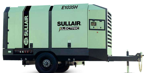
E Series Electric Range (launching in 2025)