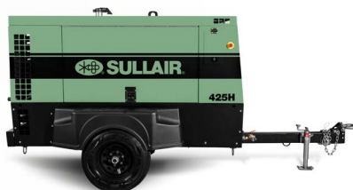
375XH, 425H Series