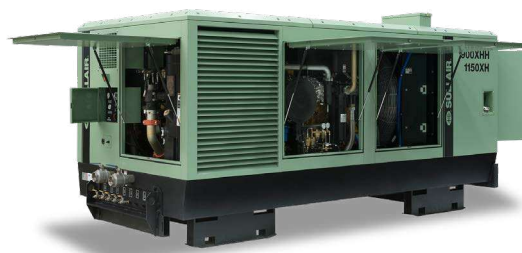
Combos 900/1150, 1250/1525, Open Frame Series