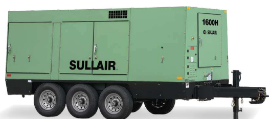
1300, 1450, 1600