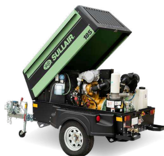
185, 260H, 320 Series

Designed for reliability and accessibility, Hitachi Global Air Power's portable air compressors work whenever and wherever you're working.