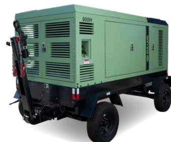
660RH, 780XH, 900H Series